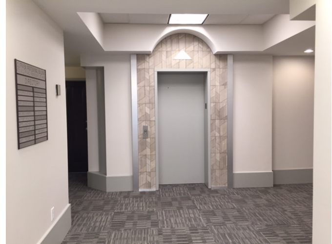
All new common areas