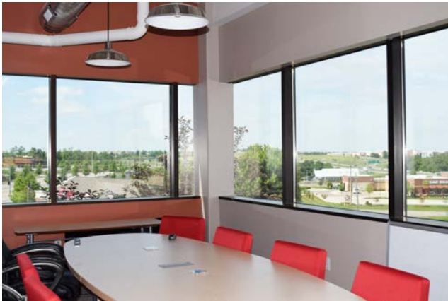
16 corner offices per floor