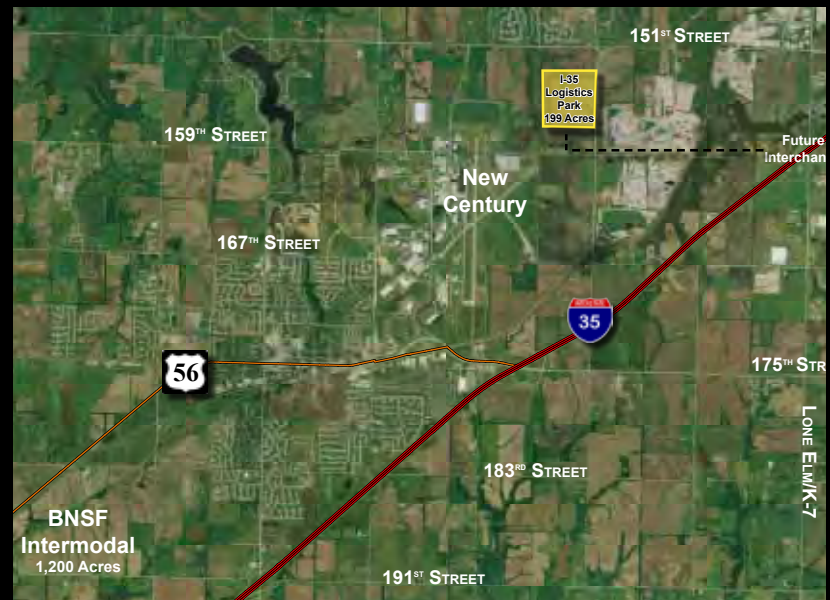
I-35 LOGISTICS PARK OLATHE, KANSAS SITE LAYOUT PLAN (PRELIMINARY - V13)